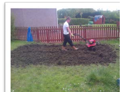
Shawhead Primary School